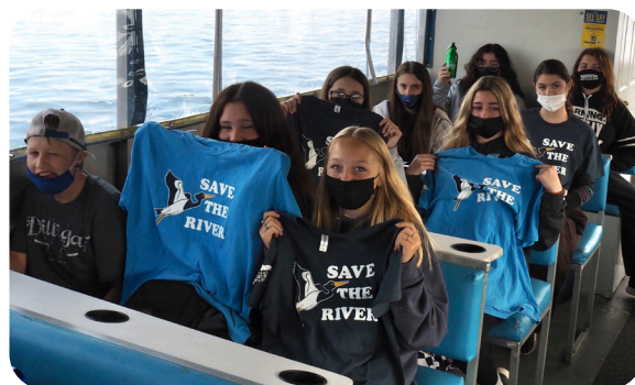
Alexandria Bay Central School District's Living History Students