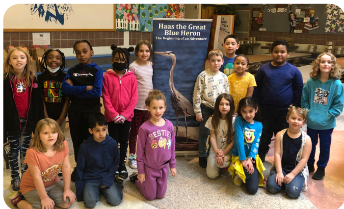
Students from Calcium's 2nd Grade enjoyed learning about Haas!